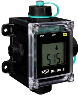
DL-101-E or DL-101-E-W