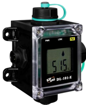
DL-101-E or DL-101-E-W

In addition to this guide, the package includes the following items: